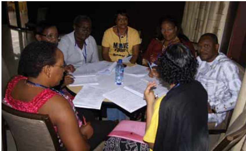
Participants develop ideas for their project activities, at a workshop in Accra, Ghana, in December 2010.

To kick-start the project, sub-regional workshops were held. One for IUF unions in English-speaking countries of Africa was organised in Johannesburg, South Africa, on 19-23 November 2007, facilitated by the South African labour education organization Ditsela. Two weeks later a similar workshop was held in Cotonou, Bénin, for IUF unions in French-speaking countries of West Africa.