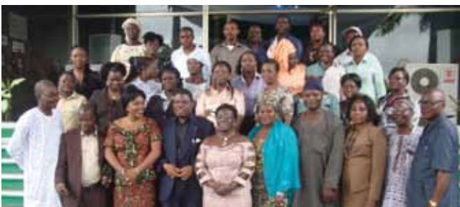
Participants at a capacity-building workshop in Nigeria (left), and taking action on domestic workers' rights in Burkina Faso (right).